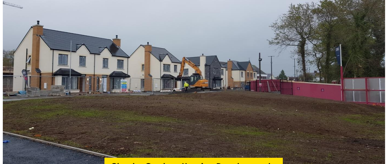
Chantry Gardens Housing Development